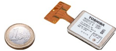
Figure 4: The audio players, digital cameras and smartphones that emerged at the end of the 1990s were initially equipped with hard disk drives – flash memory was far too expensive at that time. Manufacturers developed HDD drives with 1.8 inches, 1 inch and also this tiny one from 2004, which measures only 0.85 inches and holds 4 Gigabytes.

In the next development stage, microwave-assisted switching MAMR (MAS-MAMR), the microwaves will activate the material of the magnetic discs to further reduce energy input and enable a further reduction in the size of the write head. However,