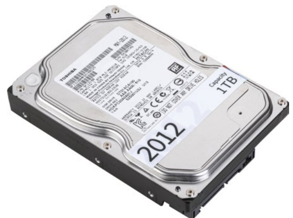
Figure 7: Flash is displacing hard drives from many devices, so HDDs can only succeed with large capacities. The drives broke the Terabyte barrier in the early 2010s, catching the rapidly swelling data wave of the information age in data centres and cloud environments.