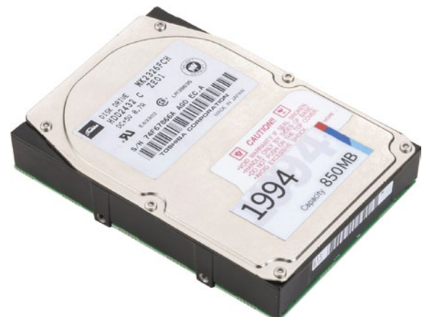
Figure 2: At the end of the 1980s, 3.5-inch drives became popular; here is a model from 1994 with 850 Megabytes. The form factor is still standard in PCs, servers and storage systems today.