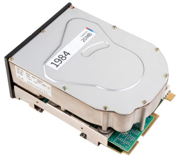
Figure 1: A hard disk model from 1984 that stores 20 Megabytes. At that time, the drives were increasingly being installed in PCs, but at 5.25 inches they were still much larger than today's hard disks. The interfaces were also not yet standardised – PATA came later.

The flash boom meant that HDDs could only succeed with high capacities at favourable costs. Perpendicular magnetic recording (PMR), a new recording method, led to a real leap in capac-