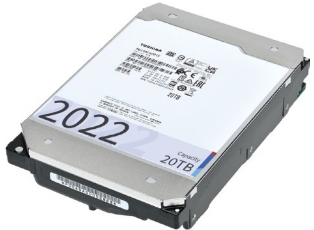
Figure 9: The advanced MG10 Series is the answer on the data growing at an explosive pace. Announced in 2022, these HDDs, boost the capacity up to 20 Terabytes which is 11.1% more than its predecessor. With its improved power efficiency and increased capacity, these HDDs help cloud-scale service providers and storage solution designers to achieve higher storage densities for cloud, hybrid-cloud and on-premises rack-scale storage.