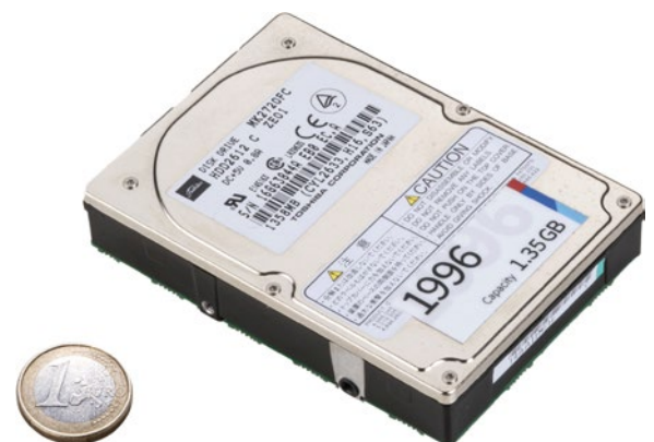
Figure 3: The increasing demand for notebooks led to a boom in 2.5-inch hard disks, and in the mid-1990s the Gigabyte limit was passed. Since mobile computers are now mainly equipped with SSDs, 2.5-inch drives are now used almost exclusively in external USB enclosures.