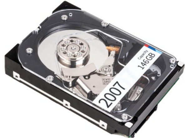
Figure 5: In the mid-2000s, the new recording method PMR (perpendicular magnetic recording) caused enormous leaps in capacity. Hard disks could suddenly hold well over 100 Gigabytes. The high data volumes made new interfaces necessary: SATA replaced PATA in the client area and SAS followed SCSI in the data centre.