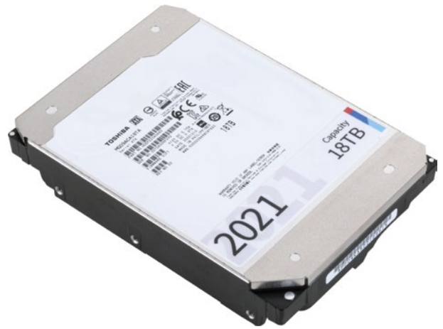
Figure 8: In 2021, a new generation of hard disk drives entered the scene, relying on the new MAMR (microwave-assisted magnetic recording) method. The first model had a capacity of 18 Terabytes, and its successor in 2022 has already brought it to 20 Terabytes.

However, it seems unlikely that the next 40 years will see another leap in capacity like the one from 20 Megabytes to 20 Terabytes. Hard drives in the early 2040s would then have to offer 20 Exabytes of storage capacity – ten times that of a modern cloud data centre. On the other hand, the proud owner of a 20 Megabyte hard disk in the early 1980s probably never dreamed of models with 20 Terabytes.