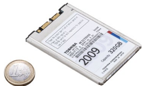
Figure 6: This flat 1.8-inch hard drive from 2009 is equipped with a single magnetic disk that can store 320 Gigabytes and is used in compact notebooks, among other things.